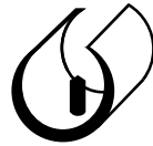
4 x Feet (Provided)

NB. Assembly should be carried out on a soft surface or mat to protect the product.